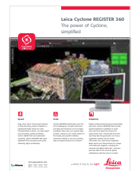
Leica Cyclone REGISTER 360