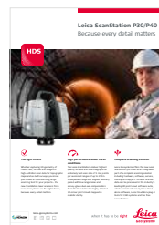
Leica ScanStation P30/P40

Illustrations, descriptions and technical specifications are not binding. All rights reserved. Printed in Switzerland – Copyright Leica Geosystems AG, Heerbrugg, Switzerland 2017. 869145en - 12.20