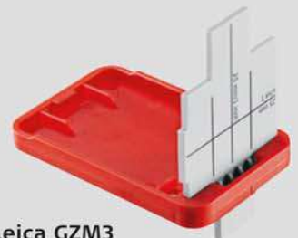
Leica GZM3 target plate Art.No. 820 943