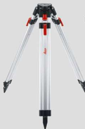
Leica TRI 200 tripod with 1/4" thread Art.No. 828 426