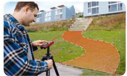
Measuring points and areas