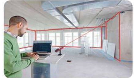
Real-time transfer of point coordinates