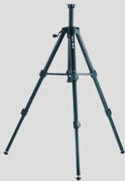
Leica TRI 70 tripod Art.No. 794 963