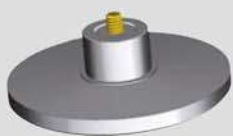
Adapter for laser tripods Art.No. 828 416