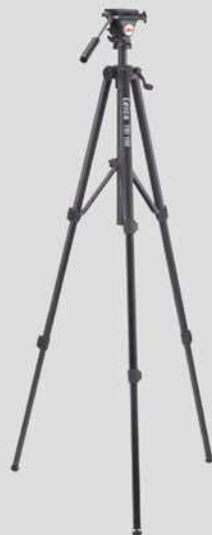
Leica TRI 100 tripod Art.No. 757 938