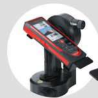
Leica FTA360-S adapter Art.No. 828 414